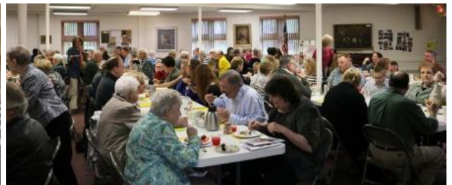
Approximately 160 attendees for Asbury's 25th Anniversary Celebration enjoyed a scrumptious lunch provided by funds from Asbury's UMW.