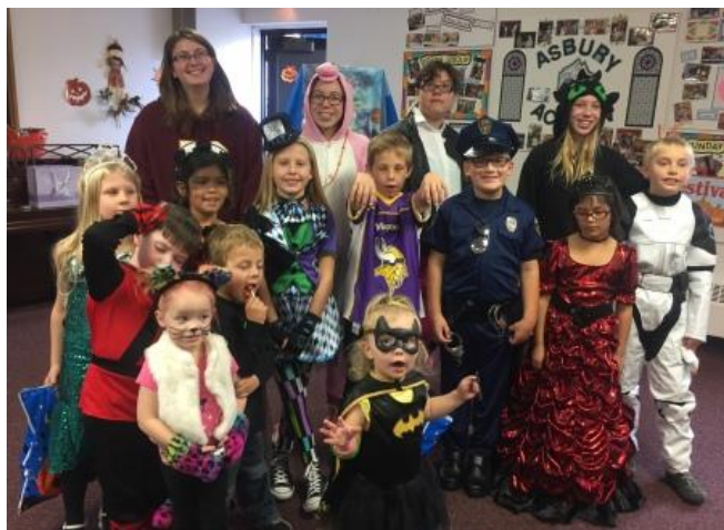
The children thoroughly enjoyed Fall Fest held on Sunday, October 22.