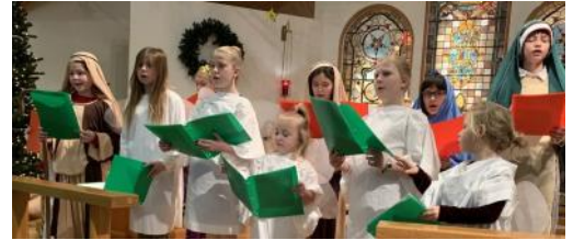
Our Sunday school choir sang "Little Star" and "Twinkle Twinkle"

O n Sunday, December 15, the children and youth of Asbury UMC presented the Christmas Story "The Star of Christmas." There were UPS deliverers, Salvation Army bell ringers, a Christmas tree salesman, ballerinas and "Mom" all vying to be the "star" of Christmas. Right in the middle of deciding on who the "star" was, the question was posed, "Are