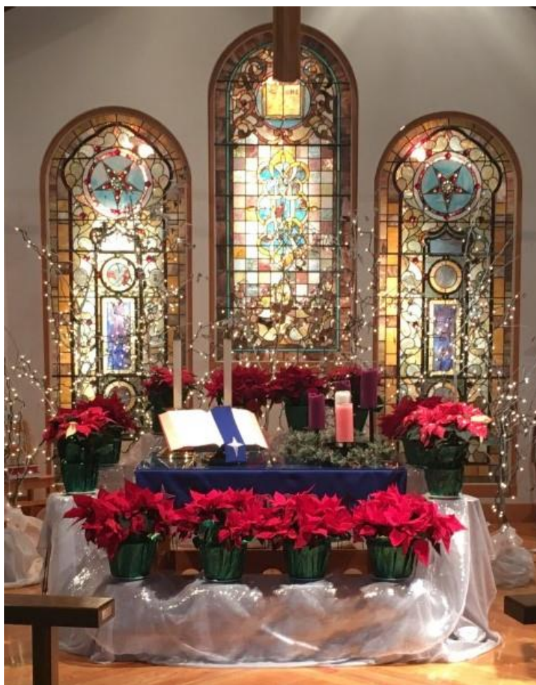
Asbury's beautiful Christmas Eve display!