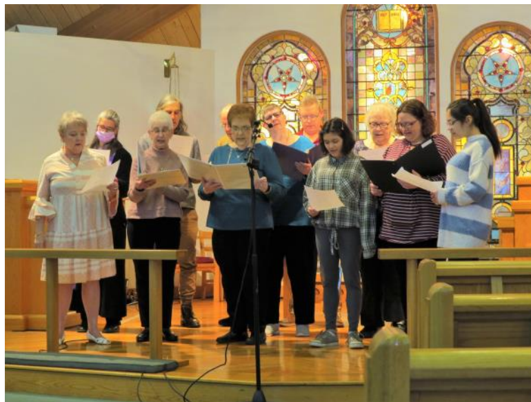
A huge thank you to our Asbury Singers. They will be singing at the May 7 worship service and then taking a break until September.

Please sign up or call the church office by May 11. There is a sign-up sheet on the table in the Narthex. Grandma's Marathon needs about 80 volunteers for the dinner so your help will be very much appreciated. Plus it should be a lot of fun!