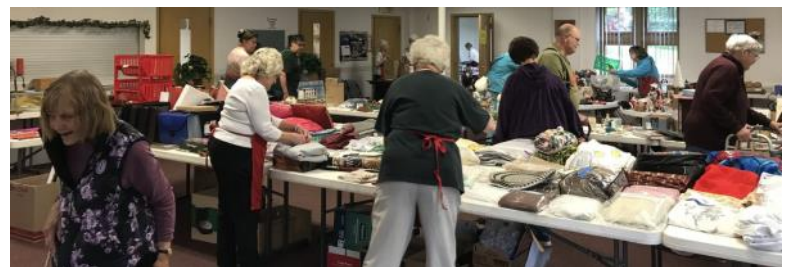
The rummage sale was busy both outside (L) and inside the Fellowship Hall.